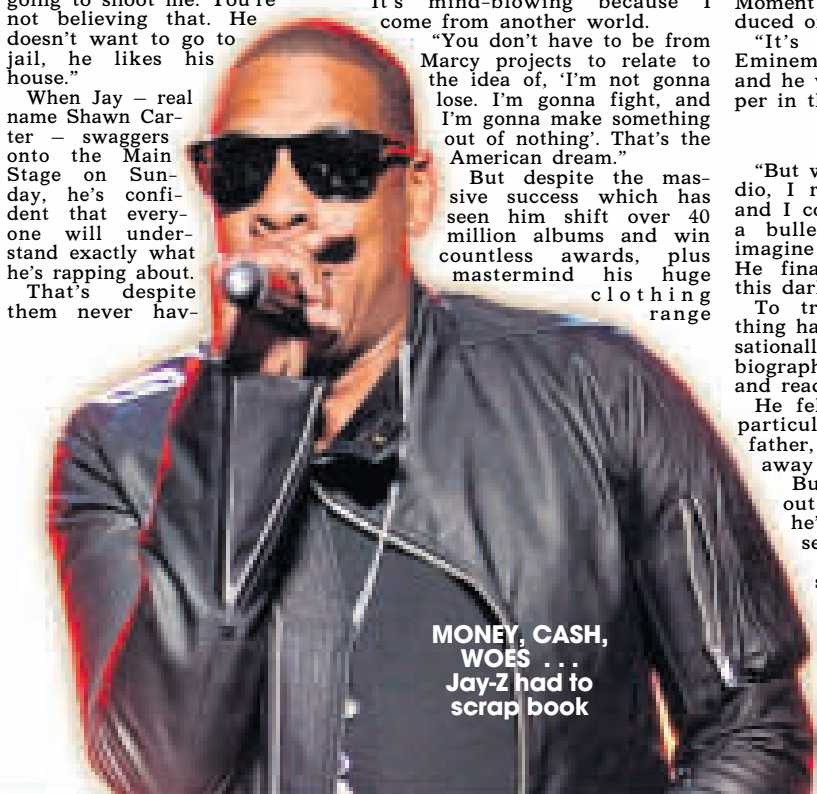
MONEY, CASH, WOES . . . Jay-Z had to scrap book