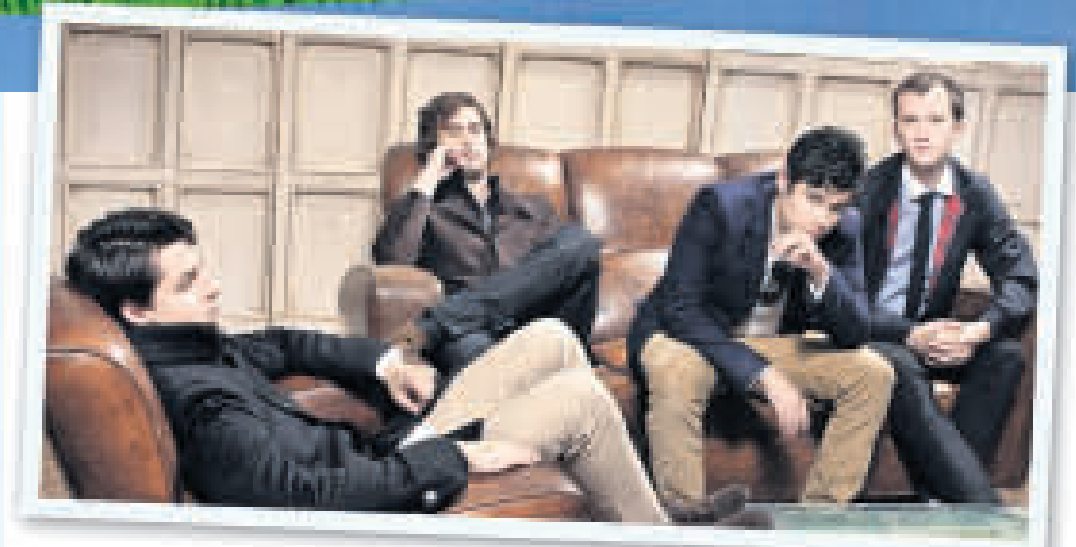
INDIE band Vampire Weekend — probably the brainiest bunch at Balado — seem ready to abandon their back-up plan for earning a living.

But Jay will put all that out of his mind at T, where he'll be backed up by his sensational live band. He'll even grudgingly sacrifice some of his favourite tracks in order to keep the energy up. He added: "I'm always trying to look for energy and I'm not necessarily playing everything. I want to play." CS ● Jay-Z plays the Main Stage on Sunday.